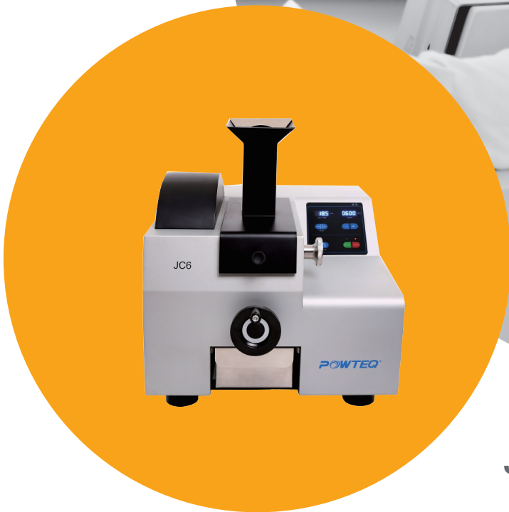
Jaw Crusher JC6