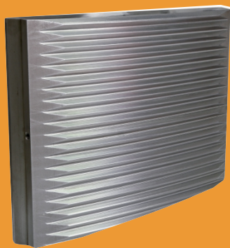
Jaw Crusher JC7